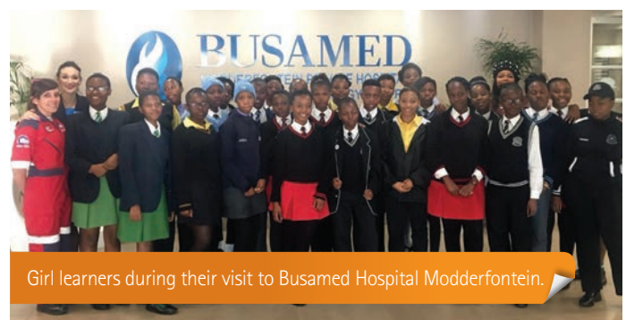
Girl learners during their visit to Busamed Hospital Modderfontein.

included the NEF-funded Smith Capital, a 50% woman-owned engineering and manufacturing company in Benoni, Busamed Modderfontein Private Hospital, a black-owned state-of-the-art medical facility in Johannesburg, Motheo Construction, a black women-owned engineering and construction company, Bonngoe Production, a multi-genre television content producer, as well as Power 98.7, a Gauteng based radio station that also broadcasts nationally via the DSTV radio platform.