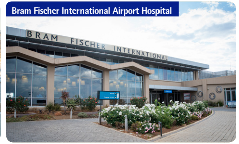
Bram Fischer International Airport Hospital