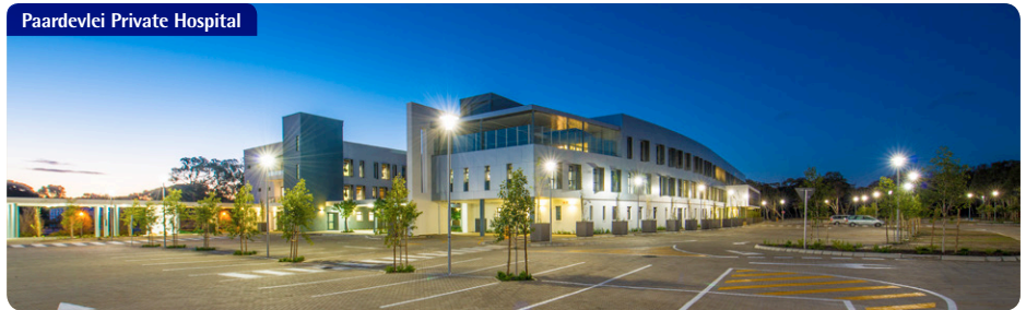
Paardevlei Private Hospital