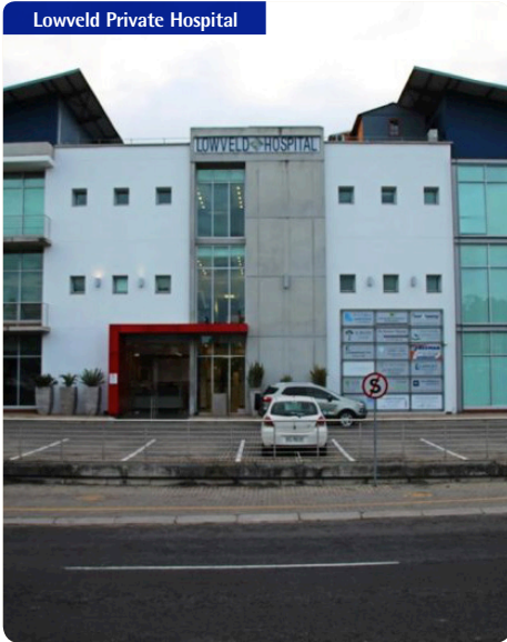
Lowveld Private Hospital