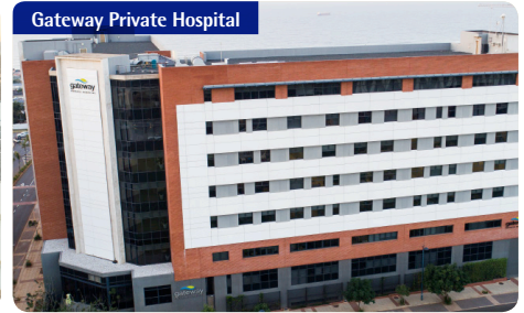
Gateway Private Hospital