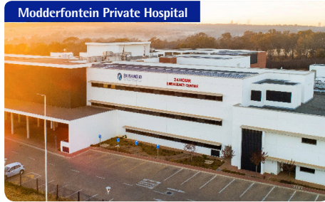
Modderfontein Private Hospital